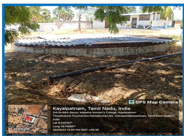
Fig: 1 Open Well (1)

Our Colleges meets water needs through a drilled well near the campus garden. Two open wells, one well behind the entrance and another well near the playground, supply water to all wings of the main building, canteen, washroom and the garden.