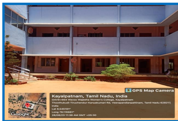
Fig : 2 Rain Water Harvesting Pipe Inside View