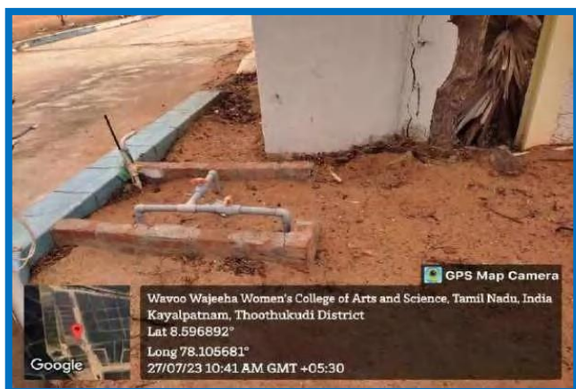
Fig: 3 Bore Well (1)