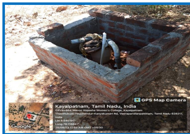
Fig: 4 Bore Well (2)