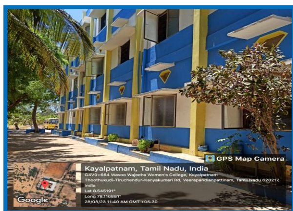
Fig : 1 Rain Water Harvesting Pipe OutSide View

The water saved in cement tubs which are further used for watering the plants and this would raise the underground water level. A similar structure is also maintained inside the indoor open auditorium to save rain water. By this procedure, rain water is prevented from falling straight on the ground and getting evaporated during day time in the hot sun. Instead, this would raise the underground water level.